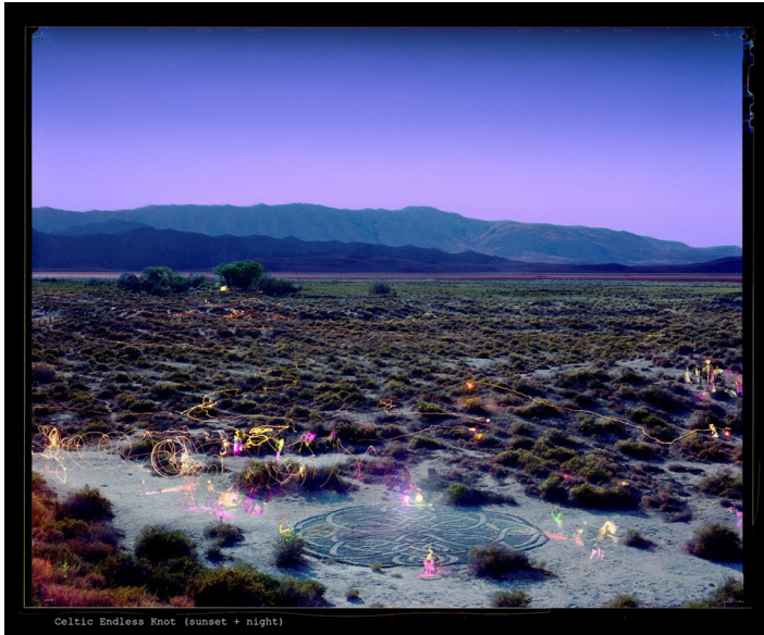
Celtic Endless Knot. Through Day and Night* Ritual at Paul Windsor's sand drawing – a pathway tracing a Jungian archetypal symbol of the Continuum of Mind."