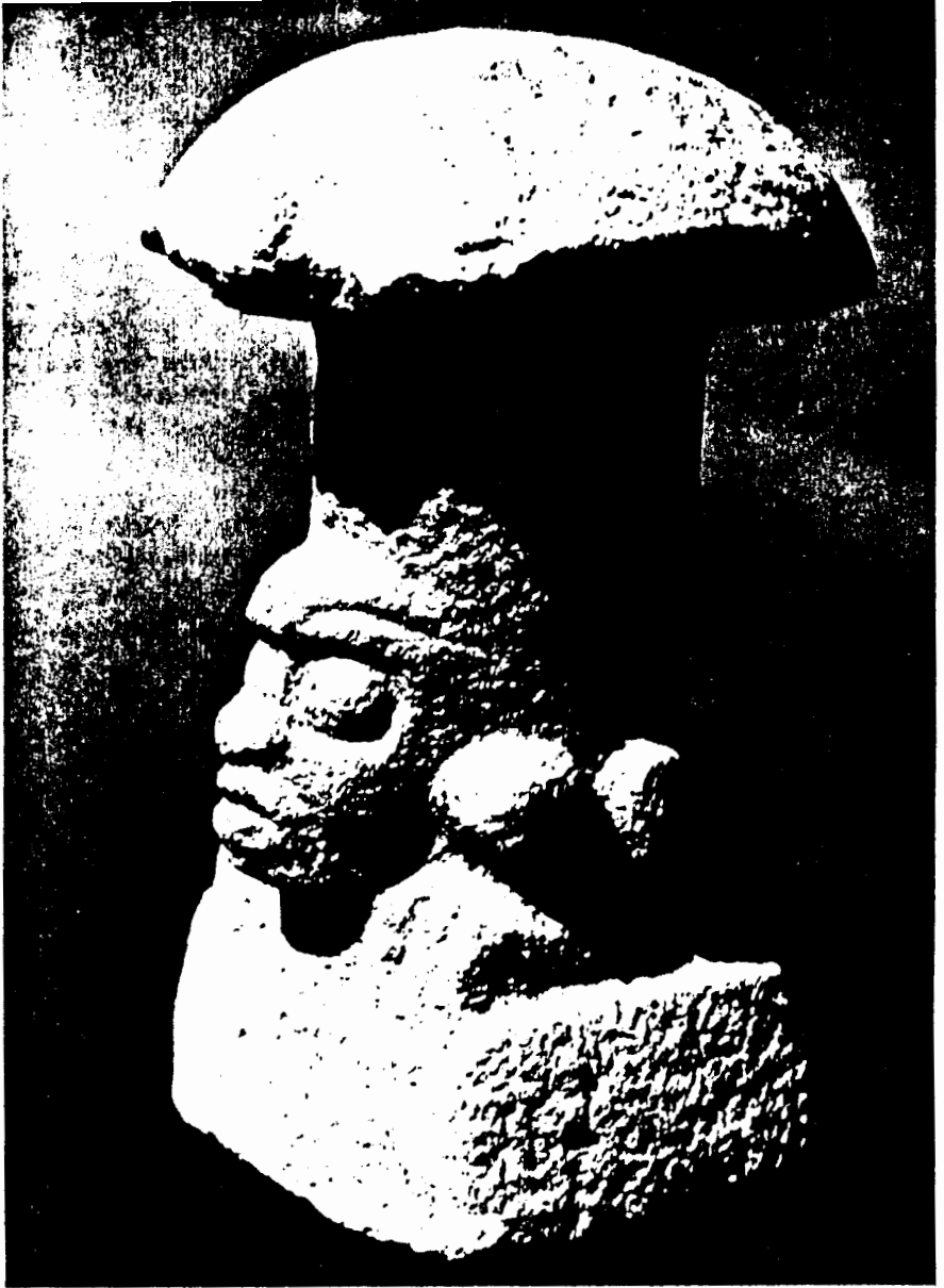
Fig. 30. A pre-Classic mushroom effigy stone from highland Guatemala, about 500 B.C. Many such stone carvings of mushrooms, dated between 1000 and 300 B.C., have been found in Guatemala, as well as in Tabasco and Veracruz in Mexico, with or without anthropomorphic and zoomorphic effigies at the base. The effigy here is a crouching jaguar with a human head, possibly signifying shamanic transformation under the influence of the hallucinogenic mushroom or depicting the guardian spirit of the sacred plant. Coll. Edwin Janss, Jr., Thousand Oaks, Calif.